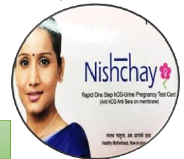
Pregnancy Testing Kit